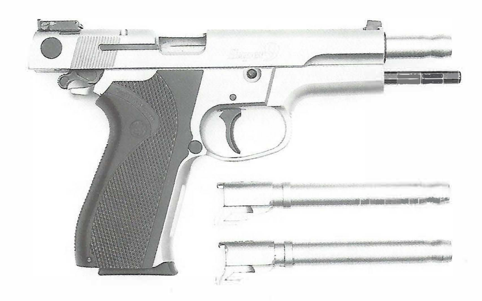
The complete package includes a gun and three runs, respectively in 9 mm Para, 9x21 and .356 TSW. The constriction near the mouth is necessary to get the walk out of the tightly fitting bus.

The PC945 launched last year was a 'licked' gun, with its skeleton trigger, skid tensioning surfaces on the sled and extended pallets and levers. The Super 9 looks a bit more modest. At the outset, the weapon has far removed from the classic Smith & Wesson double-action models, such as the 910 and 410. Like these guns, the Super 9 has a one-piece plastic grip, locking of the race in the sledge and a safety guard the left side of the carriage. In further consideration, the differences differ. The Super 9 has an extended sleigh and a longer run (127mm instead of 102mm), a less curved tractor, which has been rearranged due to the single-action mechanism, and a fully adjustable target. More high tech gadgets can not be found, and the choice of material is also the case